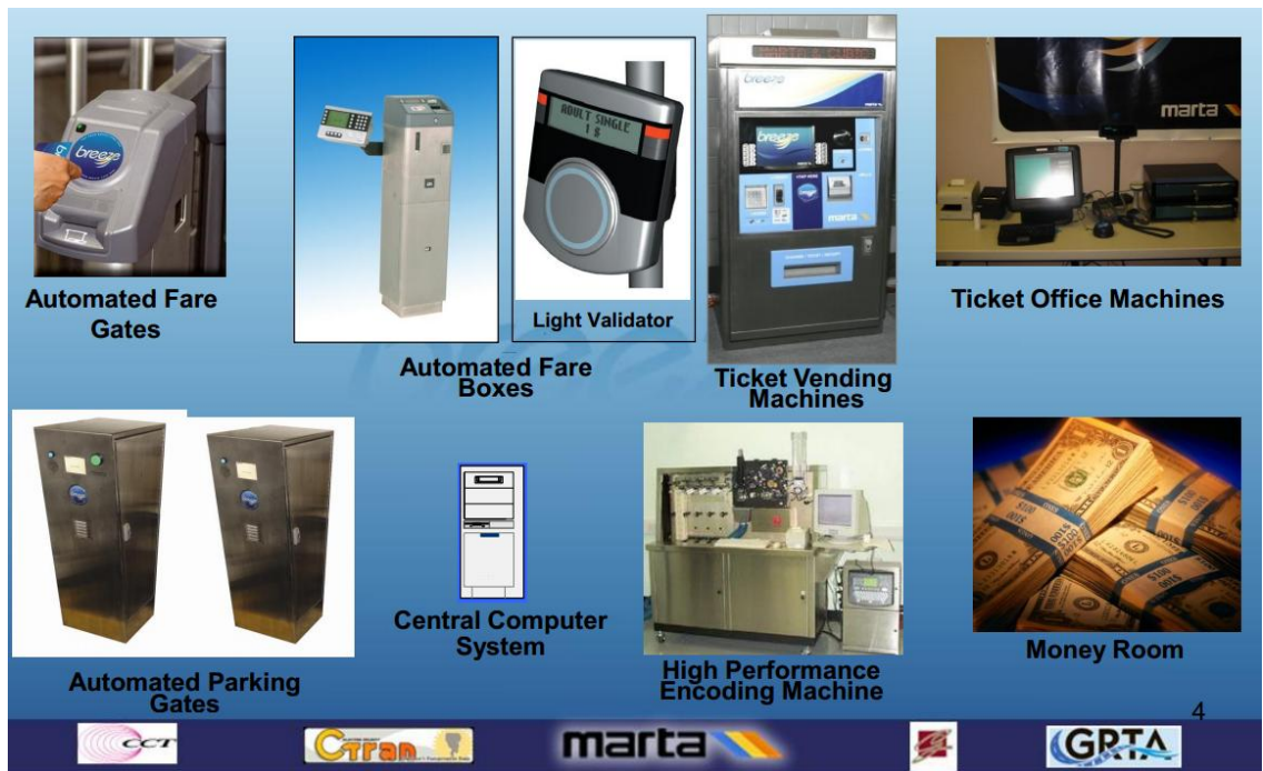
Figure 2. Graphic Overview of BREEZE Hardware Components (Source: http://www.apt.com/mc/fctt/previous/2010fare/Presentations/Breeze-Program-Overview.pdf ).

The BREEZE System consists of the hardware components pictured below in Figure 2, as well as a host of other communications devices and software components that support the operation of BREEZE and the issuance of fare products [108].