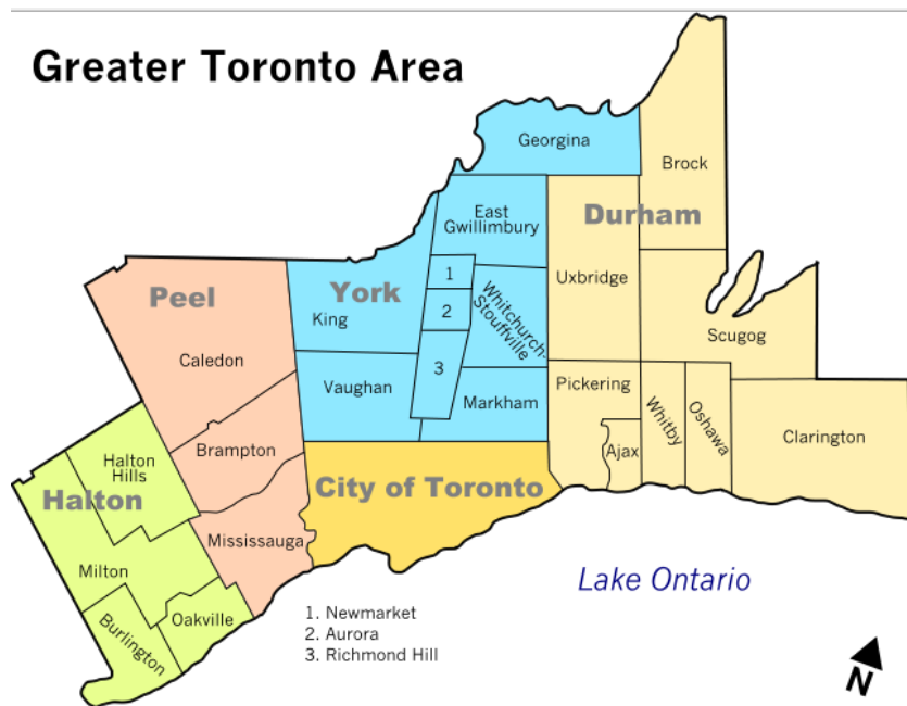
Figure 1. Municipal Map of Greater Toronto.

In the capital of Ontario, there are eight operators that provide public transit service across the Greater Toronto Area (GTA), which encompasses the City of Toronto and four regional municipalities (Durham, Halton, Peel & York), as seen in Figure 1 below.